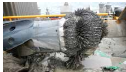
Figure 3. Swarf recovered by circulation magnet during first run.

We are a global oilfield service company that specializes in drilling services and well services because we believe that specialists do the job best. Our experience drives our difference in a constant search for new ways to deliver better wells. We listen to our customers to provide straightforward solutions to help them produce more oil and gas. We are craftsmen, who take pride in our work and always do what we promise.