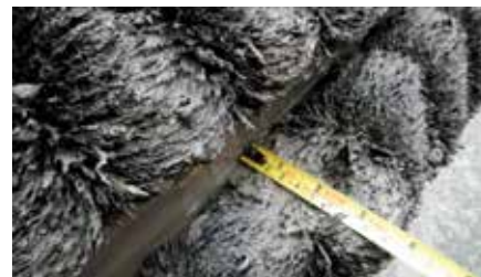
Figure 2. Close up of string magnet showing volume of swarf recovered during first run.