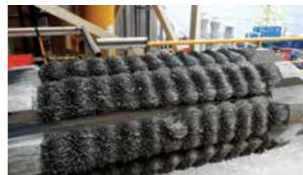
Figure 1. Swarf recovered by the string magnet during first run.