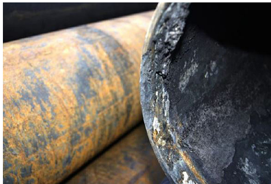
Picture of severe localized corrosion on the pin end of the 10 3/4" tubing.

Archer is a global oil services company with a heritage that stretches back over 40 years. With a strong focus on safety and delivering the highest quality products and services, Archer operates in 40 locations over 19 countries providing drilling services, well integrity & intervention, plug & abandonment and decommissioning to its upstream oil and gas clients. We are Archer.